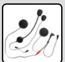
BTH103 Bluetooth Hi-Fi Speakers