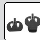
BTA102 Mounting Kit